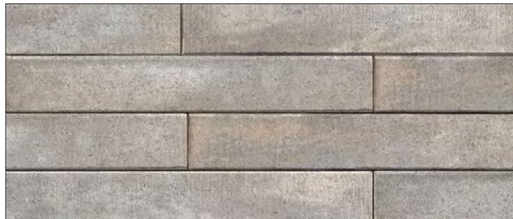
GRANITE BLEND SAFARI NEW