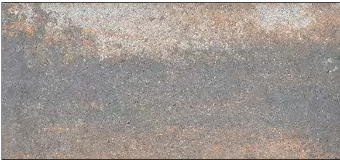
ALMOND GROVE FUSION