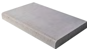
BULLNOSE 14 x 24 x 2 3/8" 360 x 600 x 60mm