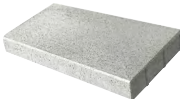
CHAMFERED 14 x 24 x 2 3/8" 360 x 600 x 60mm