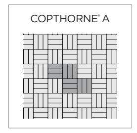
COPTHORNE A 100% Standard