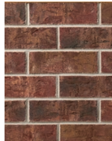
VIENNA Sizes: Premier Plus