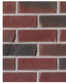
CRIMSON Sizes: Premier Plus