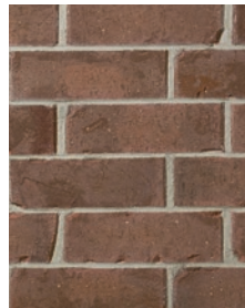
MADISON COUNTY Sizes: Premier Plus