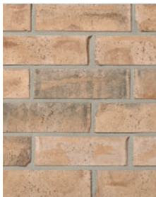
PROVIDENCE Sizes: Premier Plus