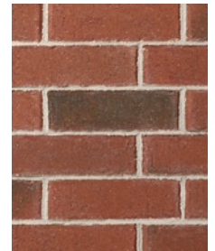
OLD CHICAGO Sizes: Premier Plus