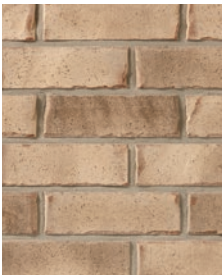
CANYON Sizes: Premier Plus

All colors in this series are stock items. Manufactured in our Brampton, Ontario plant.