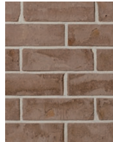
WESTMONT Sizes: Premier Plus