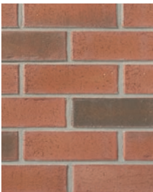
OLD SCHOOL Sizes: Premier Plus