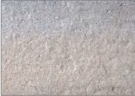
CLIFFSIDE GREY NEW Only available in 48" Step