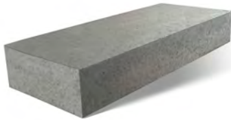
48" STEP 20 x 47¼ x 7" 500 x 1200 x 180mm