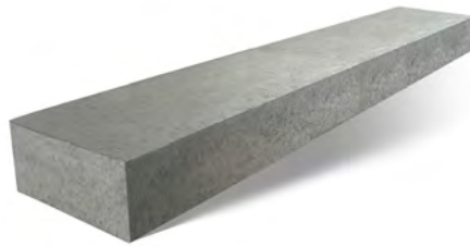
72" STEP 20 x 70¾ x 7" 500 x 1800 x 180mm Not available in Cliffside Grey or Irish Coast

2 Edge details available on the same unit (Chamfer and Rounded).