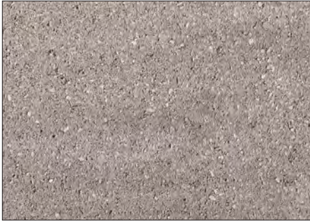
IRISH COAST NEW Only available in 48" Step